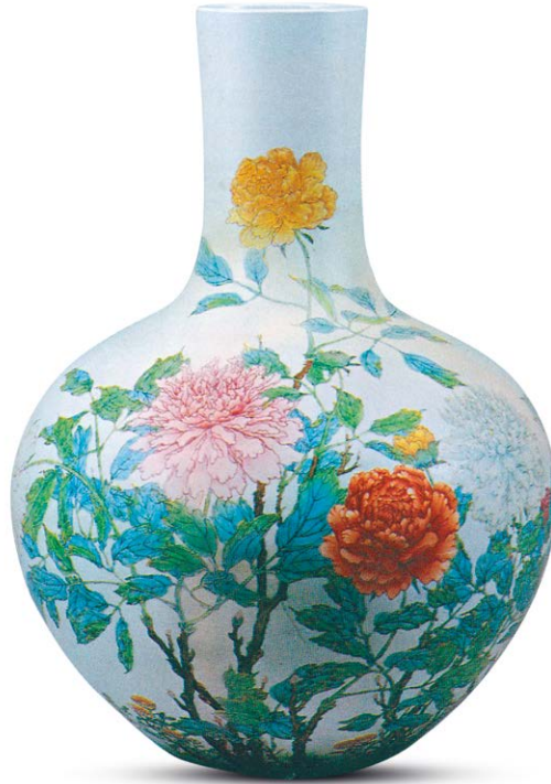
fig. 2 A famille rose 'peony' tianqiuping , Yongzheng mark and period (1723–1735) Collection of Tokyo National Museum Image: TNM Image Archives 圖二 清雍正 粉彩牡丹紋天球瓶 東京國立博物館藏品

Complete Collection of Treasures of the Palace Museum, vol. 38, Hong Kong, 1999, p. 274, no. 251 (fig. 3). Even the famous Qianlong doucai dragon moon flask in the Palace Museum (illustrated by E. S. Rawski and J. Rawson (eds.) in China – The Three Emperors 1662–1795 , London, 2005, pp. 294–5, no. 217) is 6 cms. smaller than the current vase, while the large Qianlong doucai charger, decorated with the Eight Buddhist Emblems, from the imperial collection in the Nanjing Museum (illustrated in Qing Imperial Porcelain of the Kangxi, Yongzheng and Qianlong Reigns , Nanjing, 1995, no. 104) is 5 cm. smaller. The famous Qianlong doucai flask with a design of a farmer ploughing his fields (inspired by the 1696 Yuzhi Gengzhi tu , Imperially commissioned Pictures of Tilling and Weaving) in the collection of the Tianjin Museum of Art (illustrated in Zhongguo wenwu jinghua daquan – Taoci juan , Taipei, 1993, p. 442, no. 936) is of comparable size to the current vase.