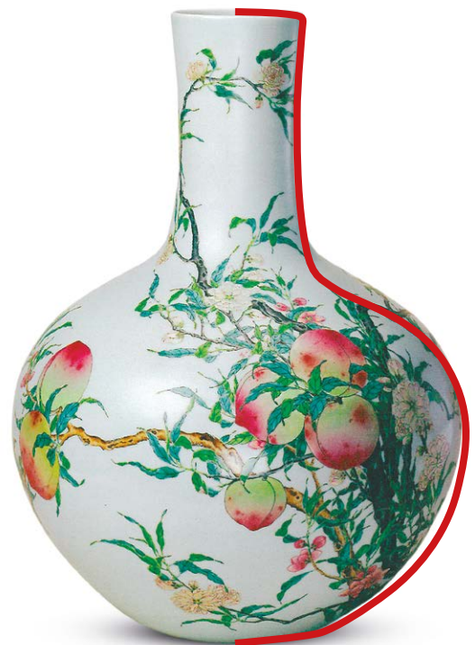
fig. 4 A famille rose tianqiuping , Qianlong mark and period (1736-1795) Collection of the Palace Museum, Beijing 圖四 清乾隆 粉彩九桃天球瓶 北京故宮博物院藏品