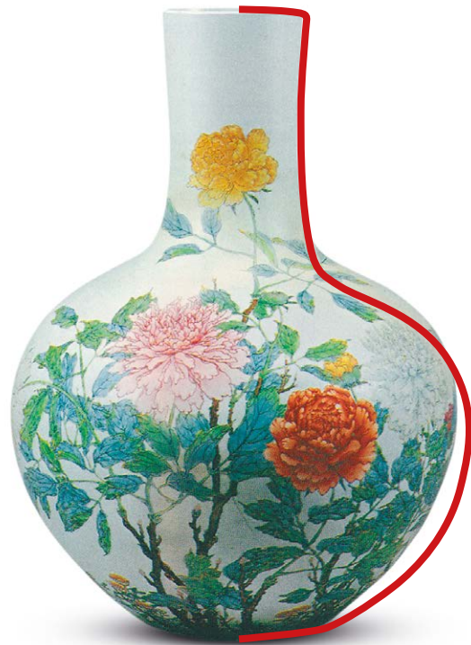
fig. 2 A famille rose 'peony' tianqiuping, Yongzheng mark and period (1723-1735) Collection of Tokyo National Museum 圖二 清雍正 粉彩牡丹紋天球瓶 東京國立博物館藏品