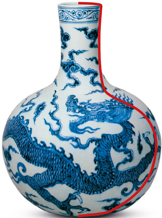
fig. 1 A blue and white tianqiuping , Yongle period (1403-1425) Collection of the Palace Museum, Beijing 圖一 明永樂 青花龍紋天球瓶 北京故宮博物院藏品