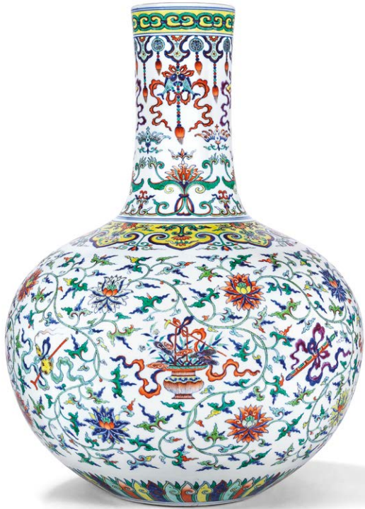
The current lot 本拍品