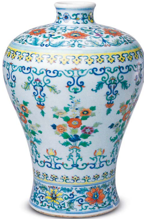
fig. 4 A doucai meiping, Yongzheng mark and period (1723-1735) Collection of the Palace Museum, Beijing 圖四 清雍正 鬥彩花卉紋梅瓶 北京故宮博物院藏品

The choice of decorative motifs on the current vase are rare on Qianlong doucai porcelains. The body of the vase is decorated with a delicate lotus scroll with multicoloured blossoms and punctuated with the Eight Daoist Emblems tied alternately with red and blue ribbons. The Eight Daoist Emblems are the attributes of the Eight Daoist Immortals. The fan belongs to Han Zhongli, the gourd (which contains magic potions) and iron crutch belongs to Li Tieguai, the bamboo drum and metal drum sticks belong to Zhang Guolao, a lotus or bamboo sieve belong to He Xiangu - the only female member of the group, who is regarded as the patron saint of housewives, a basket of flowers or peaches belong to Lan Caihe, the sword and fly whisk belong to Lu Dongbin, the pair of castanets belong Cao Guojiu, and the flute belongs to Han Xiangzi. While these attributes were seen accompanying the Eight Immortals from the Yuan dynasty (1279-1368), it was only in the Qing dynasty that the attributes alone became a popular motif, imbued with the same auspicious wishes as the immortals to whom they belonged. It seems that the Daoist Emblems' first appearance alone on porcelains was in the Yongzheng reign. While the Qianlong Emperor, like his father and grandfather, was a devout Buddhist, the inclusion of Daoist symbols on an imperial vase would have been entirely appropriate in view of their auspicious message.