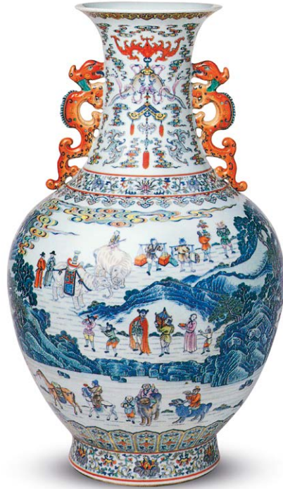
fig. 3 A doucai vase depicting tribute bearers, Qianlong mark and period (1736-1795) Collection of the Palace Museum, Beijing 圖三 清乾隆 鬥彩進寶圖雙螭耳瓶 北京故宮博物院藏品

It seems likely that the current vase was made at the imperial kilns early in the Qianlong reign. There are several aspects of the decoration that suggest this dating. Perhaps most telling is the delicacy and use of colour seen in the doucai decoration, which is akin to that of the Yongzheng reign. The underglaze blue outlines are both paler and narrower than those found on the majority of Qianlong doucai vessels, while the blue washes are softer in appearance. The overglaze enamel colours are also applied with considerable restraint – highlighting certain aspects of the design without producing an overall gaudiness. The use of colours on the current vase may perhaps be compared with that of the Yongzheng doucai meiping in the collection of the Palace Museum, Beijing, which is illustrated in Porcelains in Polychrome and Contrasting Colours , The Complete Collection of Treasures of the Palace Museum, vol. 38, Hong Kong, 1999, p. 245, no. 225. (fig. 4) There are also small details, such as the style of the petal band which encircles the foot of the current vase. This is relatively rare in the Qianlong reign, but can be found more often on Yongzheng porcelains, such as the enamelled bowl illustrated in Porcelains in Polychrome and Contrasting Colours , op. cit. , p. 171, no. 157.