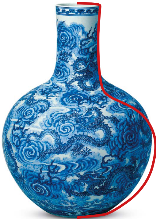
fig. 3 A blue and white tianqiuping , Qianlong mark and period (1736-1795) Collection of the Palace Museum, Beijing 圖三 清乾隆 青花龍紋天球瓶 北京故宮博物院藏品

天球瓶對陶工來說是所有器形裡最難燒造成功的一種。它不僅體型碩大，而且它最為脆弱的部位 - 肩頸交接處 - 需要承受整個頸子的重量，非常容易在窯裡坍塌。歷代陶工為了解決這個問題，利用斜肩來加強這個交接處的承重量，並且縮短脖子的高度以減輕重量。不過這樣燒出來的器形有些笨重，並且感覺上小下大，比例失調。此件天球瓶的陶工成功地拉出頸部完美的曲線，更增加了脖子的高度，使整個器形顯得秀麗靈動。這個非常細微的改變事實上需要極高的技巧，並且大幅地增加了失敗的機率。不過也因為這樣，創造出了中國陶瓷史上最完美的天球瓶子器形。