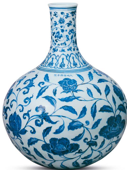
fig. 1 A blue and white tianqiuping , Xuande mark and period (1426-1435) Collection of the Palace Museum, Beijing 圖一 明宣德 青花花卉紋天球瓶 北京故宮博物院藏品

vessels. A number of tianqiuping were made in the Yongzheng reign (1723-35) – primarily with underglaze blue or overglaze famille rose decoration. An example of the latter, decorated with blossoming chrysanthemums, and somewhat smaller than the current vase, is in the collection of the Tokyo National Museum (illustrated in Oriental Ceramics, The World's Great Collections , vol. 1, Tokyo, 1976, col. pl. 80. (fig. 2)). Two Yongzheng tianqiuping of similar size to the current vase, but decorated in underglaze blue, from the Qing court collection of Palace Museum, Beijing, are illustrated in Blue and White Porcelain with Underglaze Red (III) , The Complete Collection of Treasures of the Palace Museum , vol. 36, Hong Kong, 2000, pp. 96-7, nos. 82 and 83.