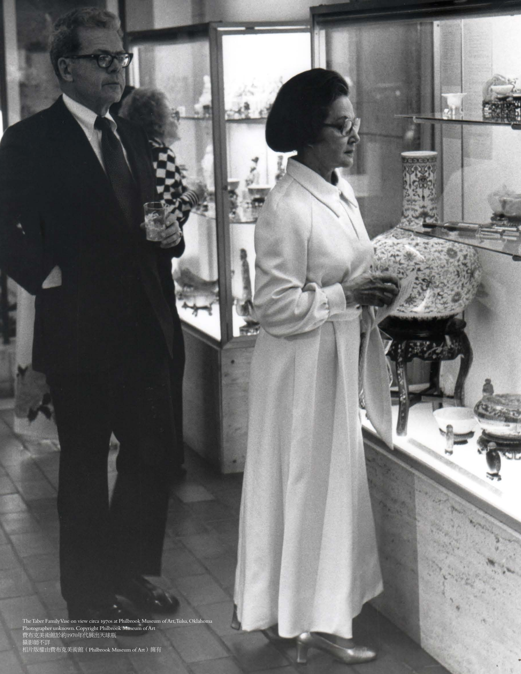
The Taber Family Vase on view circa 1970s at Philbrook Museum of Art, Tulsa, Oklahoma 費布克美術館於約1970年代展出天球瓶